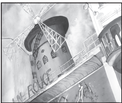
Watercolor of the Moulin Rouge

The Fresh Art Celebration and Fundraiser is from 5-8 pm at the DaVinci Gallery. Sign up for a door prize when you enter, from either the front door or our newly painted back entrance.